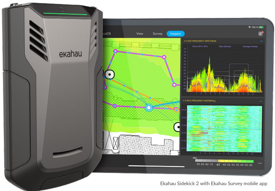
Ekahau Sidekick 2 with Ekahau Survey mobile app

macOS and iPad are trademarks of Apple Inc. Windows is a trademark of Microsoft Corporation Speed tests calculated using PSC channels only