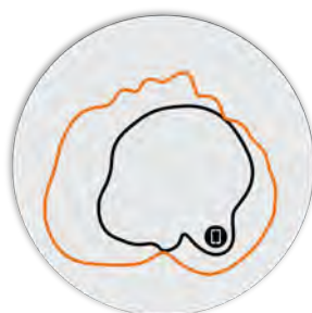
Figure 3. R350 5GHz Azimuth Antenna Patterns