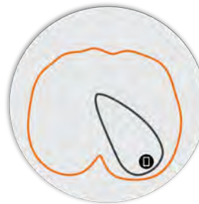
Figure 4. R350 2.4GHz Elevation Antenna Patterns