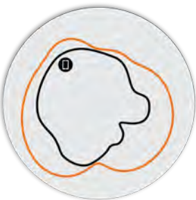
Figure 2. R350 2.4GHz Azimuth Antenna Patterns